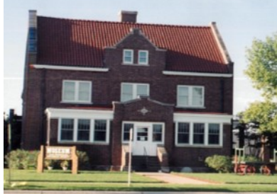
Crow Wing County Museum & Research Library Restored Sheriff's Residence