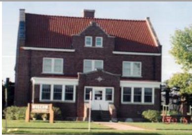
Crow Wing County Museum & Research Library Restored Sheriff's Residence