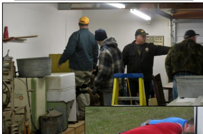
Snodeo members working on the store building at the fairgrounds.