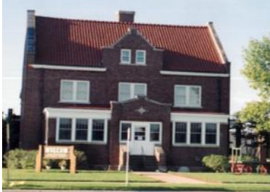
Crow Wing County Museum & Research Library Restored Sheriff's Residence