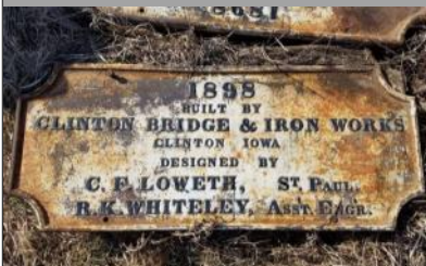
See page 3 pertaining to this plaque

The local Rotary Club took on the special project of raising funds to remodel the building. A dedicated crew of volunteers renovated the sheriff's residence and gutted the cell block area. The sheriff's residence was restored first and opened to the public in 1982. The cell block took longer. The renovation for the residence included removing all of the plaster, so insulation could be added and the building rewired.