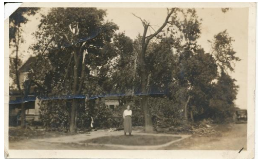
After a tornado near Gregory Park, 1919.