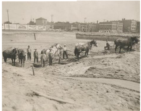
Excavation of the Crow Wing County Courthouse on August 5, 1919.