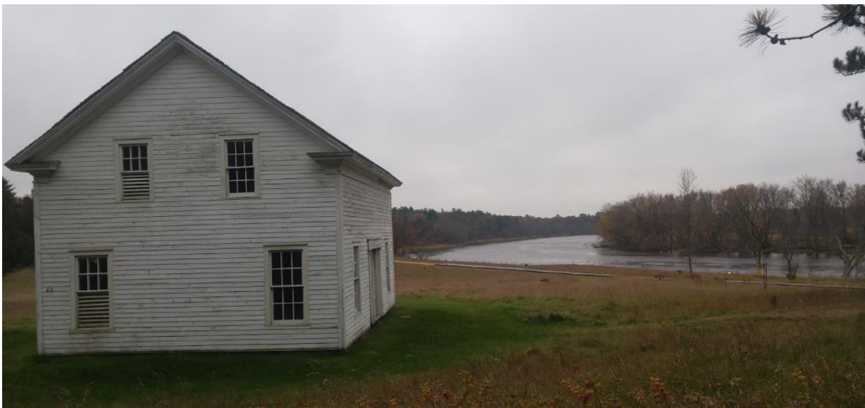
Fun Fact: Beaulieu's Crow Wing house (pictured here) is still standing and is located in the Crow Wing State Park.

Clement H. Beaulieu moved to the White Earth reservation in 1873 and passed away there on January 2, 1893.