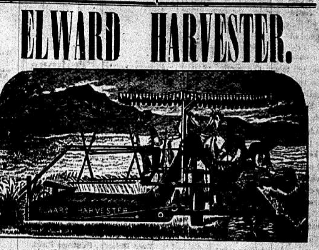
THE BEST GRAIN CUTTING MACHINE IN THE WORLD. MANUFACTURED BY SAINT PAUL HARVESTER WORKS, Saint Paul, Minnesota.