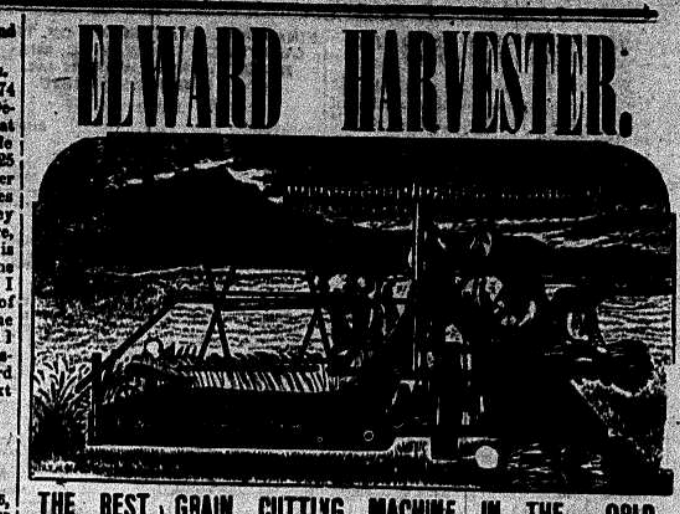
THE BEST GRAIN CUTTING MACHINE IN THE ORLD. MANUFACTURED BY SAINT PAUL HARVESTER WORKS, [mar. 9-75.] Saint Paul, Minnesota.

BRUSHES The Physicians of all kinds of skin diseases should use these brushes.