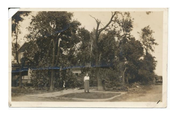
After a tornado near Gregory Park, 1919.