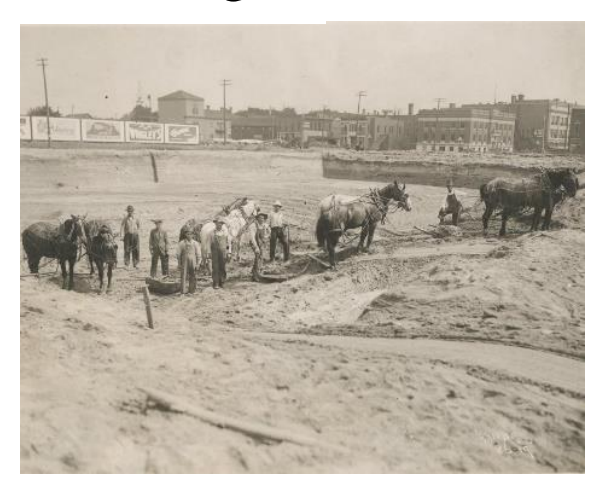
Excavation of the Crow Wing County Courthouse on August 5, 1919.